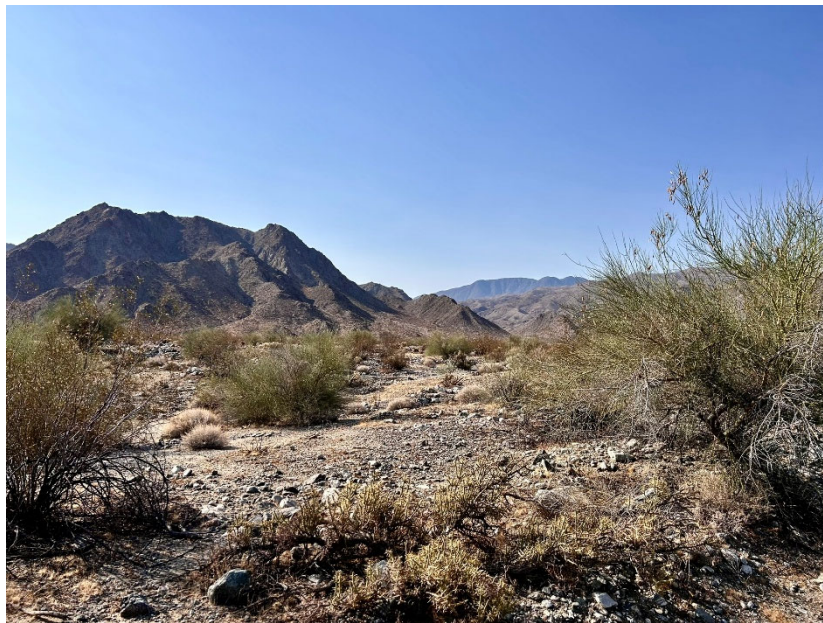
Photo from UCR NAGPRA Program’s trip with tribal partners to the Boyd Deep Canyon Desert Research Center in July 2025